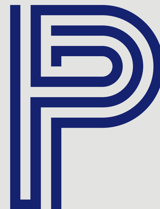
P Line Lightweight. Performance.